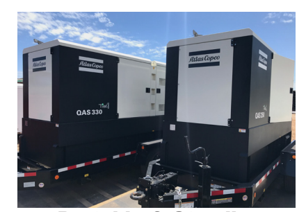
Portable & Standby Generators