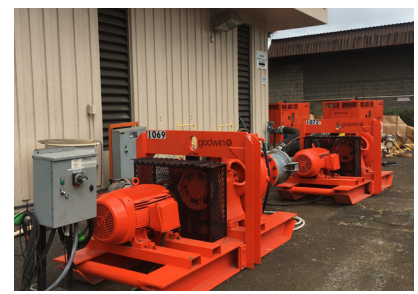
Electric Dri-Prime & Submersible Pumps