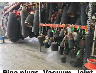
Pipe plugs, Vacuum, Joint & Mandrel Testers