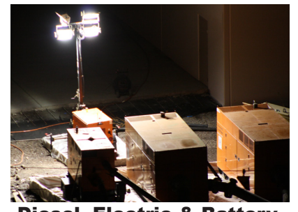
Diesel, Electric & Battery Powered Light Towers